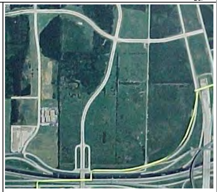
The picture above is the site that Arbor Daze is going to be held a this year

although they have not had a chance to attend class or join the ECPAAA.