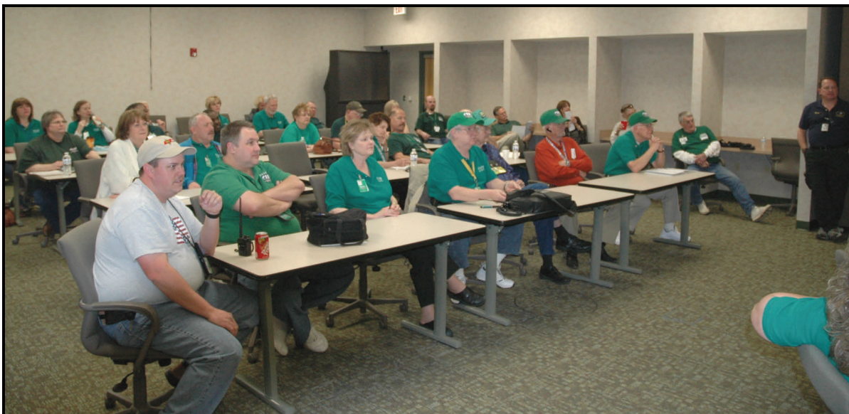
Bedford, Euless and North Richland Hills CERT Members

A huge thank you to our CERT instructors – hats off to all of you!