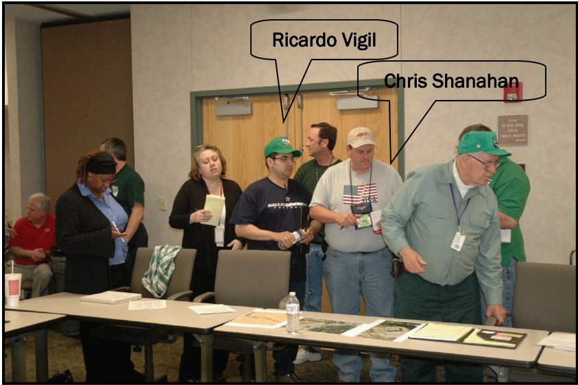
Part of Walgreen’s Team and Incident Command Team