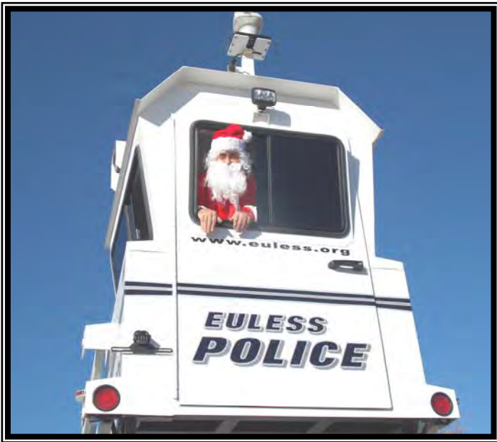
Santa in the Sky Tower watching over the Target Parking Lot November 25th