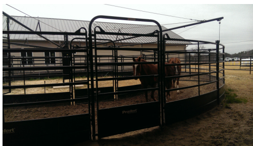
Horse walker to exercise ,warm up horses before a ride, or cool them down.