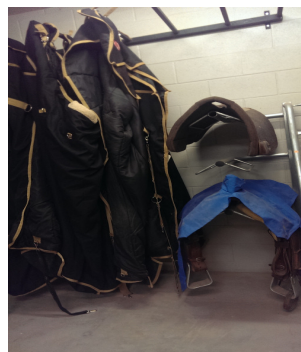
Blankets & saddle racks