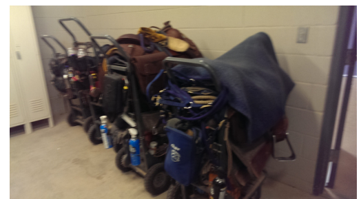
Saddle racks made of pressure washer frames