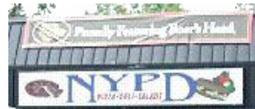
The Entire Crew