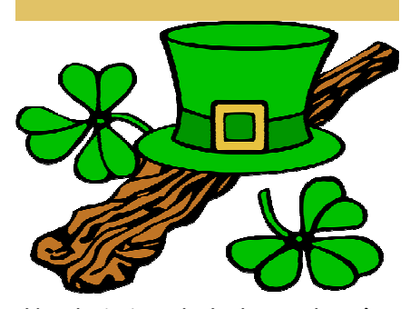
May the luck of the Irish be with you!