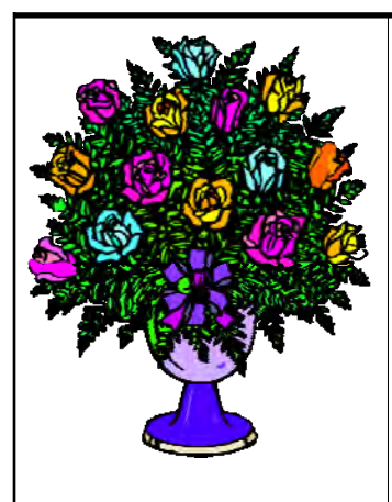
ECPAAA P.O. Box 926 Euless, TX 76039