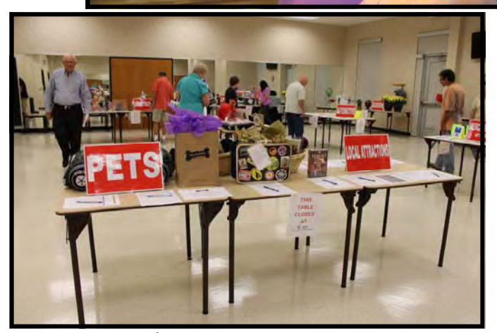
Silent Auction Room