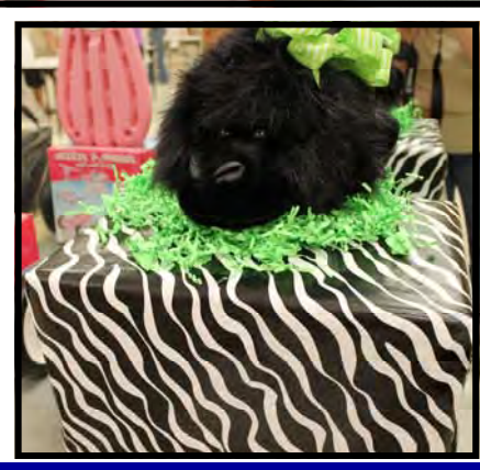
Babycakes the Gorilla in the Silent Auction Room