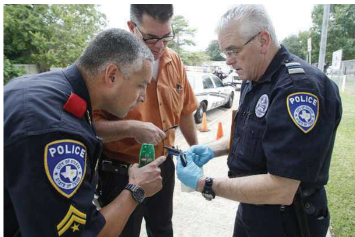
Team Members from Euless Police Department