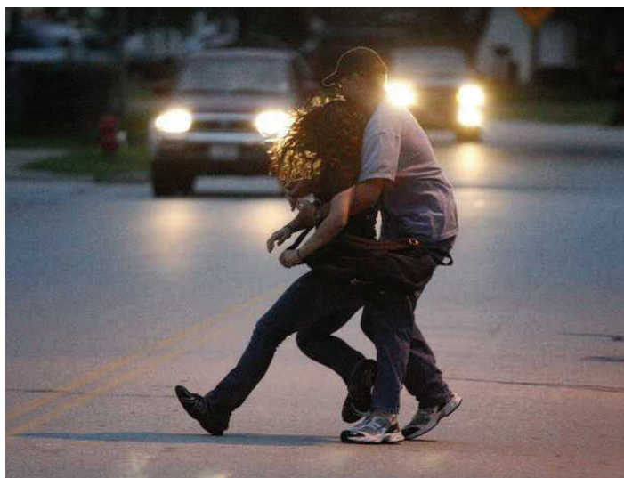
Abduction of Victim