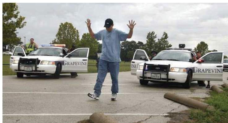
Arrest of Suspect