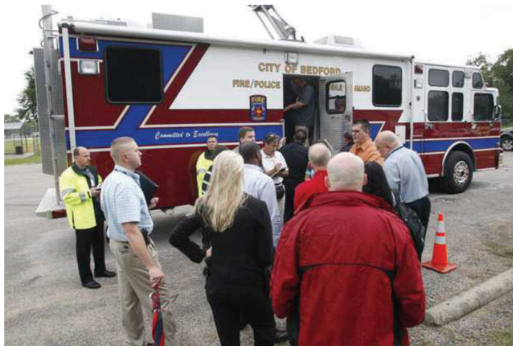
Northeast Tarrant County CART Team